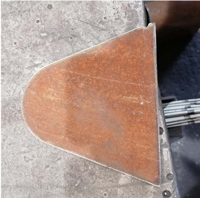
Part previously cut correctly with a file saved on the CNC hard drive